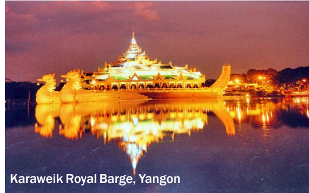
Karaweik Royal Barge, Yangon