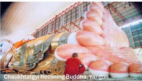
Chaukhtatgyi Reclining Buddha, Yangon

Arrive at Yangon Airport by flight. Welcome by a tour guide and transfer to Hotel. Lunch at local restaurant. After lunch, visit to Chauk Htat Kyi - a colossal reclining Buddha, Yangon City Center surrounded by various colonial style buildings of World War II & Independent Monument for photo shooting & witness the daily life of local people. Early evening visit to the world famous golden stupa, Shwedagon Pagoda - the golden dome rises 98 meters above its base and is covered with 60 tons of pure gold. Dinner with cultural show at Karaweik Palace - a famous floating restaurant located on the Royal Lake built in the style of Royal Barge used by Myanmar's old days kings. Overnight at hotel.