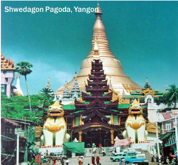
Shwedagon Pagoda, Yangon