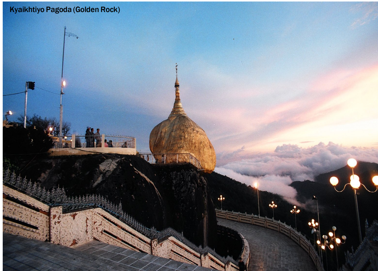
Kyaikhtiyo Pagoda (Golden Rock)